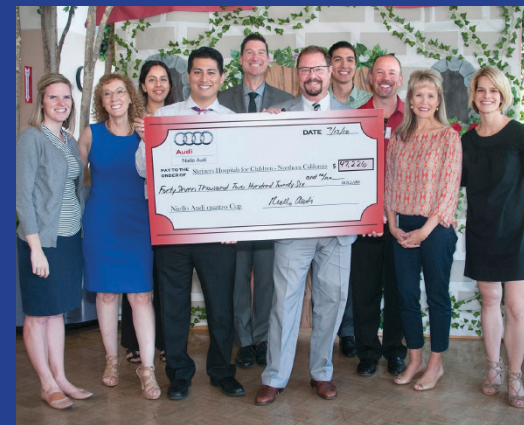
Niello Audi (Sacramento) check presentation to Shriners Hospitals for Children.