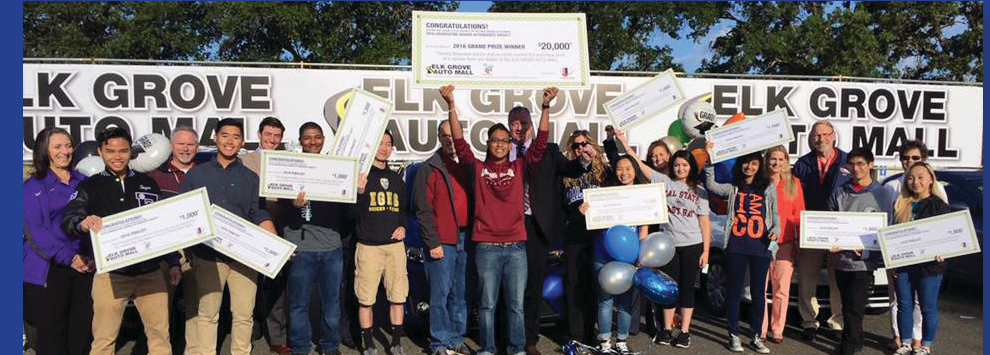
Scholarship winners presentation in Elk Grove. In 2016, a total of 161 students received scholarships from the CNCDA Scholarship Foundation totaling $118,000.