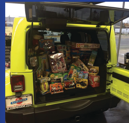
SJ Denham Chrysler Jeep Fiat (Redding) fills the jeep for its Holiday Drive