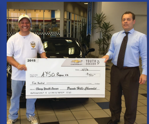
Puente Hills Chevrolet (City of Industry) check presentation to Hacienda Heights American Youth Soccer Organization

AVERAGE SALES TAX AND VLF GENERATED ON THE SALE OF A NEW VEHICLE IN LOS ANGELES: $3,363.54