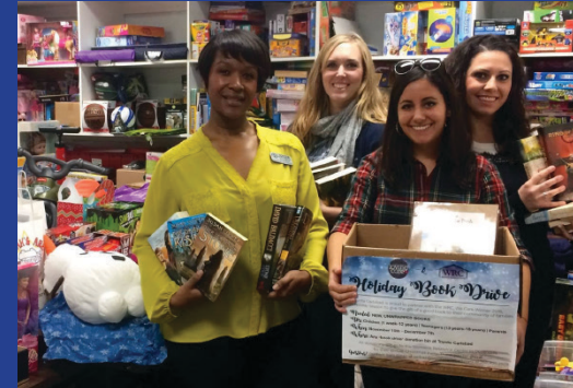
Toyota Scion Carlsbad holiday book drive for WRC Oceanside.

In 2016, California new car dealers made over $46 MILLION in charitable donations to charitable and civic organizations.